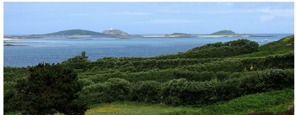
Uninhabited islands in the Scillies: St Helen's on the left, Tean on the right. Both have remains of hermit cells - where monks lived in a permanently Lenten lifestyle. Extreme? - yes! But hardly superficial.